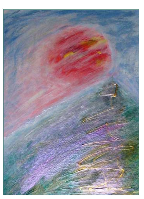
"Shooting for the Sun"

To make your order, email me at suzette@suzetteboulais.com.